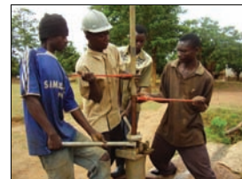
Image 1. Repair crew returns pump works fine well in Yonge, Zambia

University of Waterloo Knowledge Mobilization to Serve Society