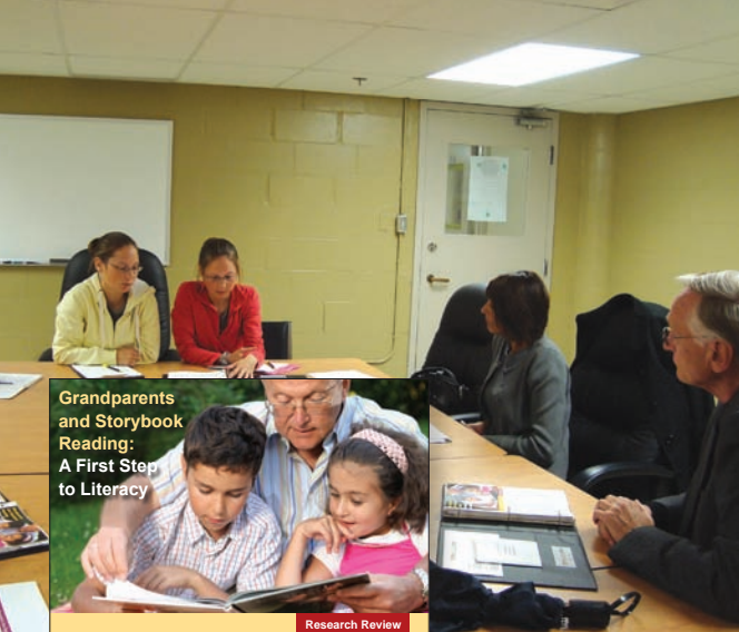
Grandparents and Storybook Reading: A First Step to Literacy

Catalyzing strategic relationships Identifying knowledge needs Customizing for application